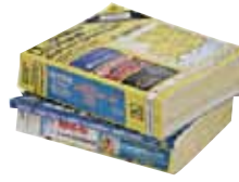
Phone Books All types & sizes