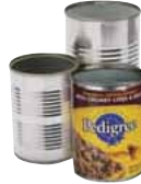
Steel & Tin Cans Empty cans only