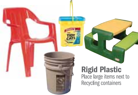
Rigid Plastic Place large items next to Recycling containers